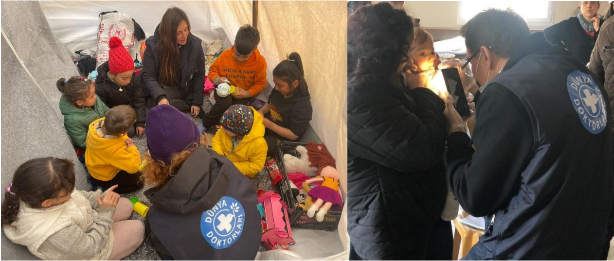
(16 th February 2023, Hatay)

Hatay, and Antakya are still very hard to reach. The vast majority of the city and buildings are destroyed, blocking roads. Some roads have been completely destroyed in the earthquake. There is no electricity, therefore the city is in darkness at night and the weather condition is unbearably cold. People, including our staff, are sleeping in the freezing cold. Numerous collective tent sites are currently being established throughout the city. Regardless, even within the tents there is a high need for heaters. The Antakya district, in particular, has been widely evacuated, with the remaining inhabitants relocating to designated tent sites managed by AFAD. The excessive buildup of dust in the city has reached levels that jeopardize the health of the public. However, residents in other districts remain steadfast in their desire to remain in their homes. Additionally, the contamination of water sources poses a significant risk of waterborne illnesses. DDD's plan is to provide information sessions and kits to prevent the mentioned illnesses. As of now, DDD is providing first aid response, health screening, medication distribution, psychological first aid for trauma, and in the process of creating safe spaces.