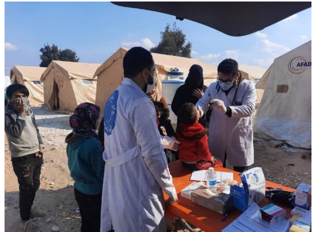
(Idlib – 13 th 2023, Idlib: Sarmada's Mobile Team visit temporary shelter camp)

The high number of people injured in the earthquake that hit Idlib has put significant pressure on the region's hospitals, which are striving to provide care and support to those affected by the disaster. However, this has led to a large amount of medical waste being generated in these hospitals. DDD's two incinerators are now receiving medical waste from most of the medical facilities in Idlib, and DDD doctors are working tirelessly to intensify their efforts to safely and effectively burn and dispose of this waste.