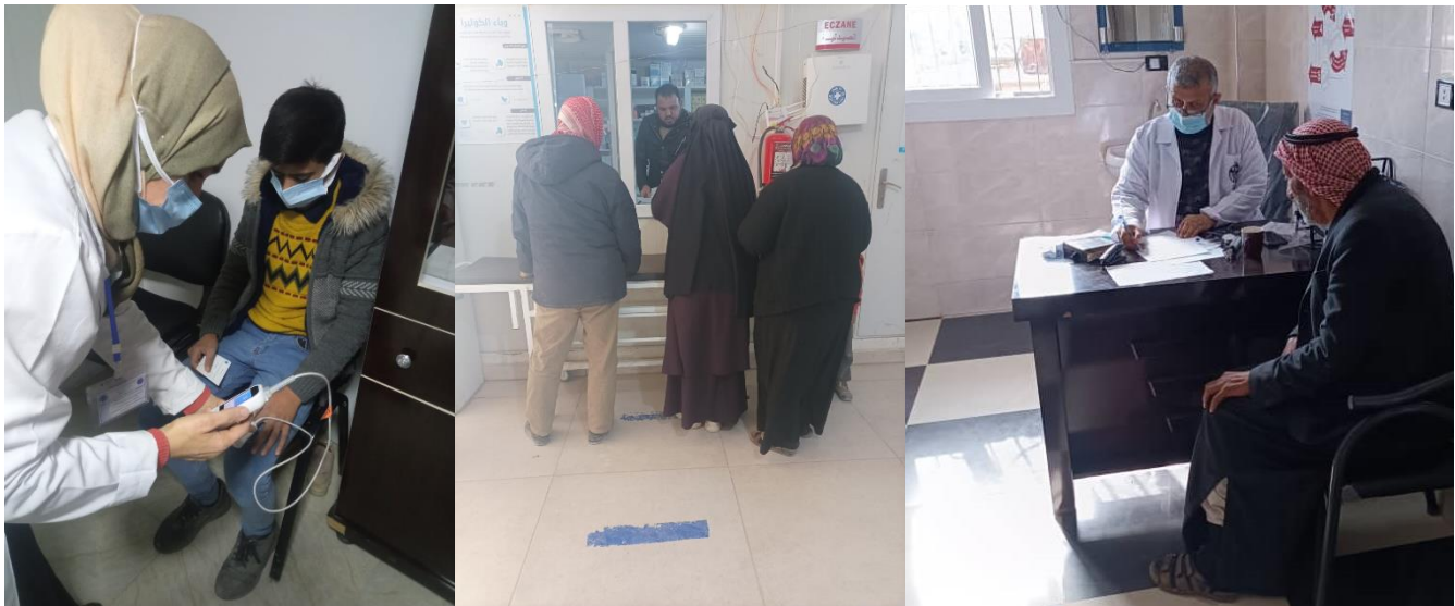
(Afrin– 14 th 2023, Idlib: Sarmada's Mobile Team visit temporary shelter camp)

Our Afrin PHCCs are open and provide emergency support. Our staff is coordinating with the Civil Defense and Hatay Health Directorate. We have seconded one of our Orthopedics Doctor to Afrin hospital to help respond to the demand. Local health authorities have also asked for our support in health services. We deployed a mobile medical team (MMT) around the region. We also have an MMU in Afrin that provides first aid response, health screenings, medication distribution and psychological first aid. In addition, DDD needs more medications, emergency aid, etc. and tents of containers for homeless staff to allow them to continue working.