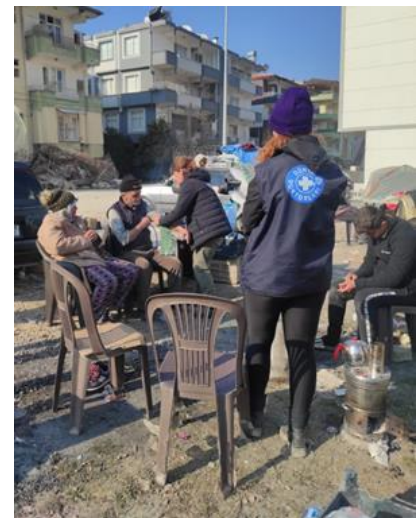
(11 th February 2023, Hatay and February 13 th Hatay: The Mobile Team provide PSS, and PHC services in the Field)