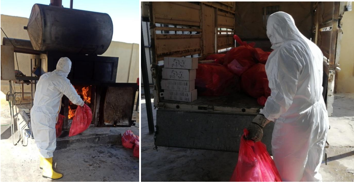
(Idlib – 14 th 2023, Idlib: Incinerators)